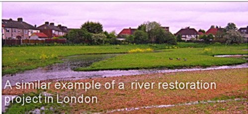
A similar example of a river restoration project in London

Enfield Council are restoring 450 metres of the watercourse along the northern boundary of Firs Farm Playing Fields that currently flows through a concrete pipe (or culvert). Phase 1 will enhance the park by introducing a watercourse with natural features and the improvement of an existing flood defence bund on the north and east boundaries of the park. Phase 2 is planned to be carried out in 2015, this will provide additional crossing points and wetland features.